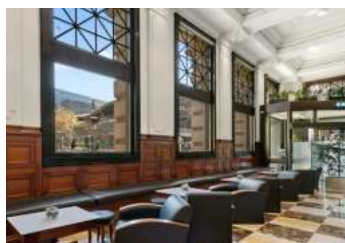
THE OAK ROOM LOUNGE