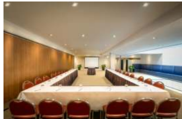
THE WILLIAM WILLS ROOM