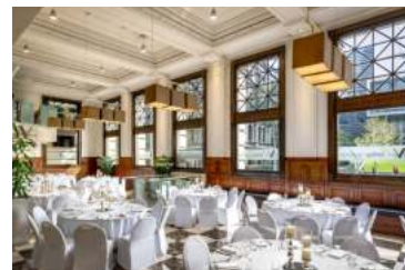
THE OAK ROOM