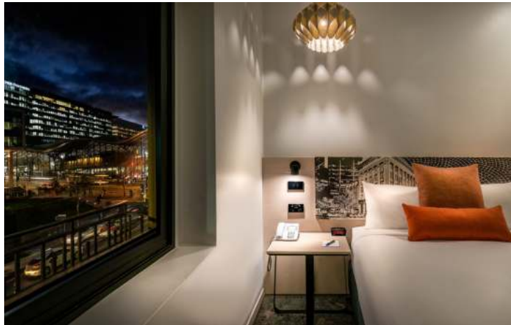
STANDARD QUEEN ROOM