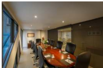
THE JOHN BATMAN BOARDROOM