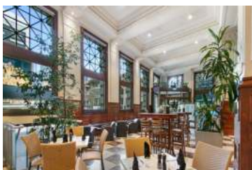
THE OAK ROOM RESTAURANT