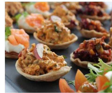
10 canapé package