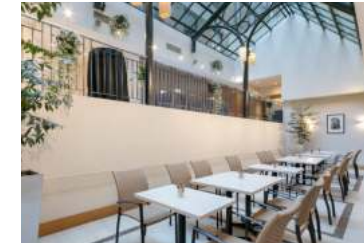
THE GARDEN ROOM