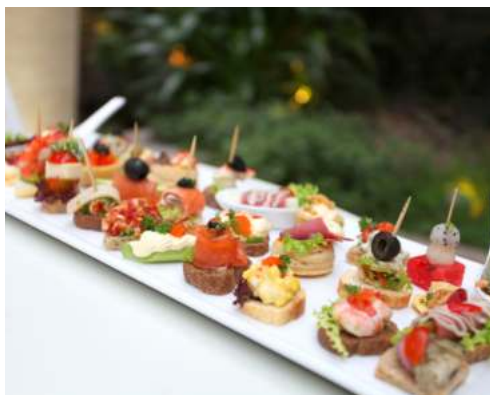
7 canapé package