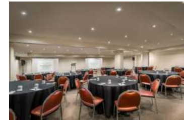
THE BURKE & WILLS SUITE