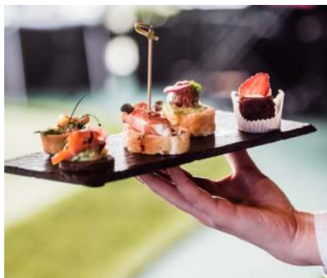
4 canapé package