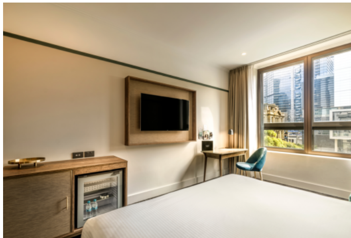
PREMIERE KING ROOM