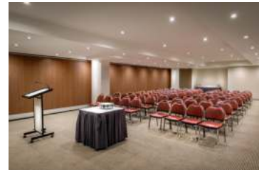
THE ROBERT BURKE ROOM