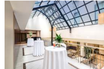
THE GARDEN ROOM TERRACE