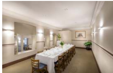
THE MATTHEW FLINDERS ROOM